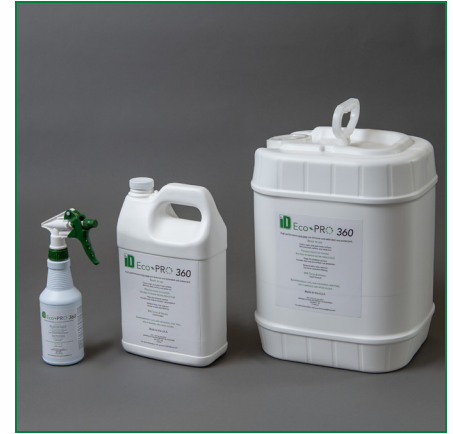
Eco-Pro 360 Solution

Water line cleaning made easy with this descaler!