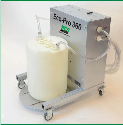
Eco-Pro 360 Descaler Cart

New product designed to clear water lines.